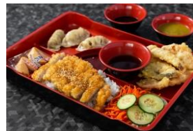
Pork Chop Bento