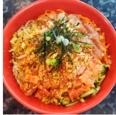
2 scoop Poké Bowl

Crispy Onion, Green Onion, Sesame Seeds, Tempura Crumbs, Nori (Seaweed)