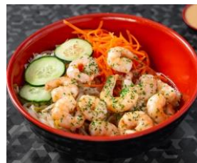
Shrimp Rice Bowl